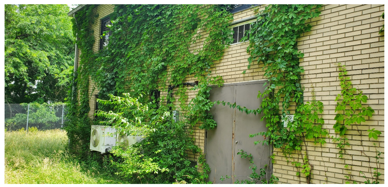
Western elevation, two-story north section, overgrown with ivy