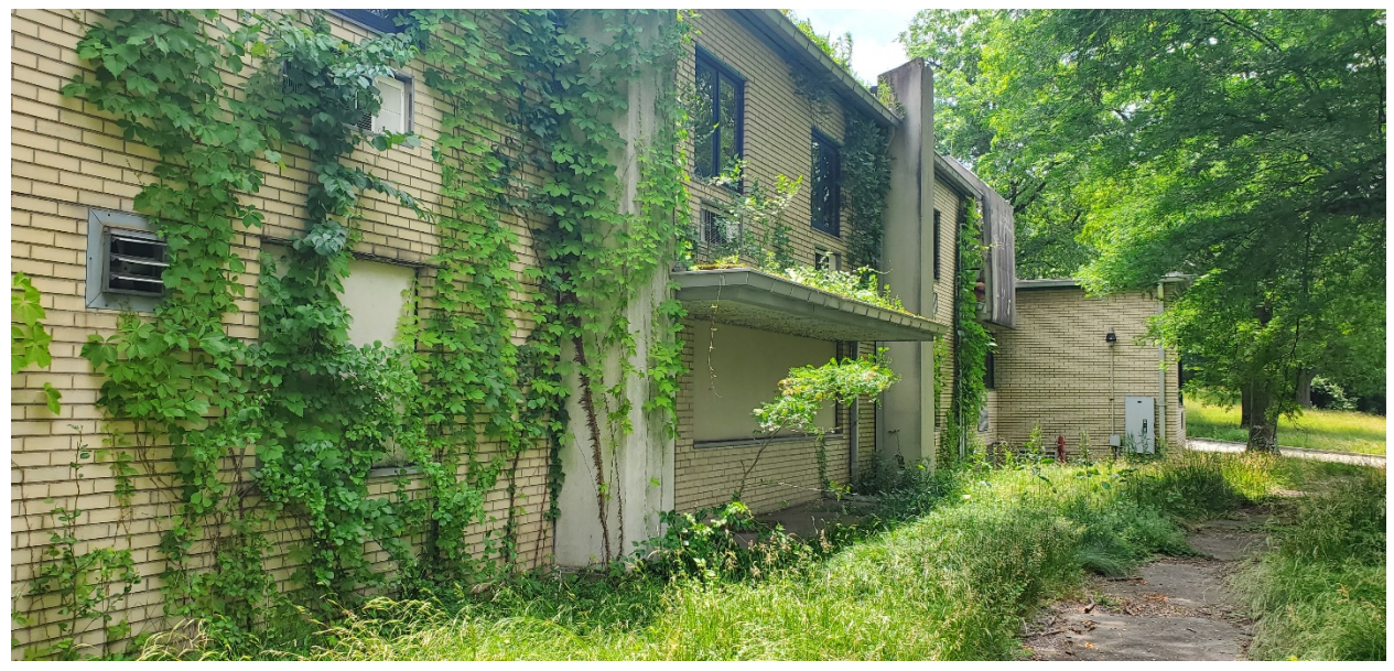
Western elevation looking south, engaged concrete columns and ivy growth