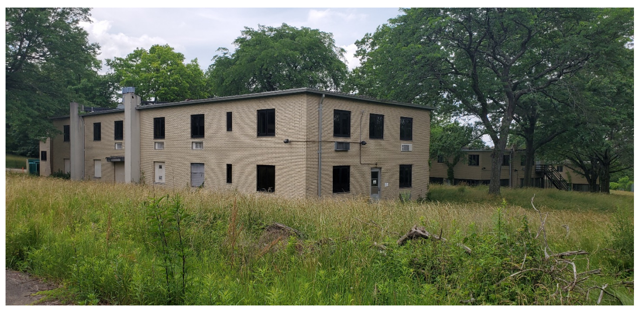
North section two-story eastern elevation with engaged concrete columns, and northern elevation