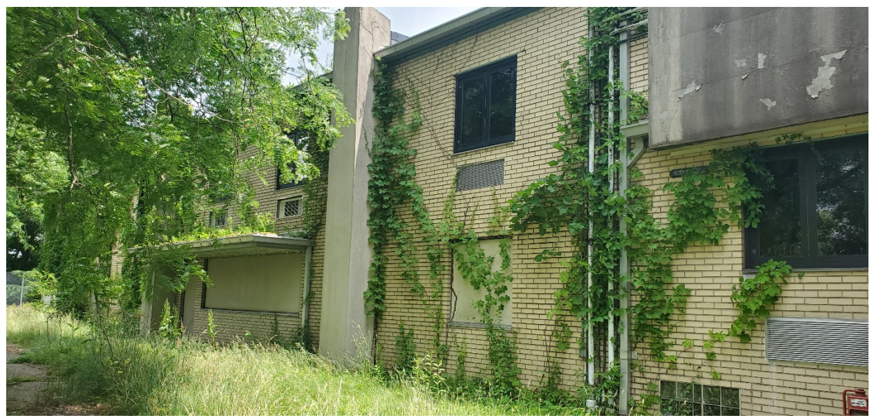
Western elevation, two-story north section with engaged concrete columns, and one-story middle bridge section with screen for HVAC