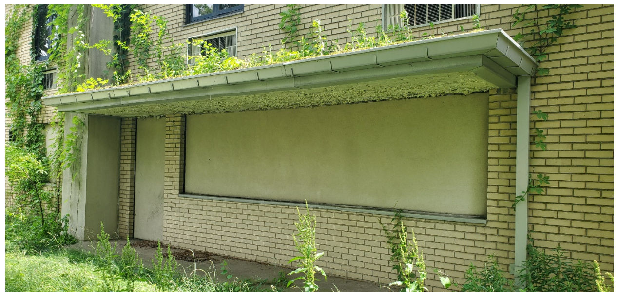
Western elevation entry door, picture window, and overgrown canopy