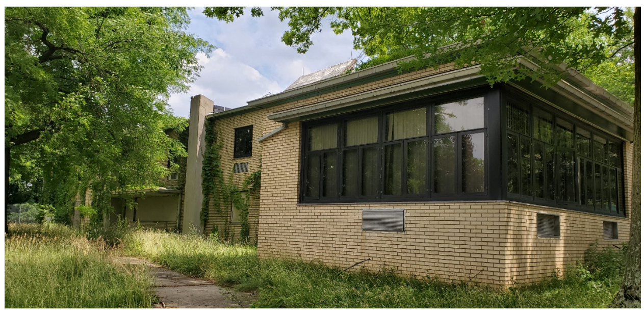
Eastern elevation, one-story south section, with continuous ribbon window