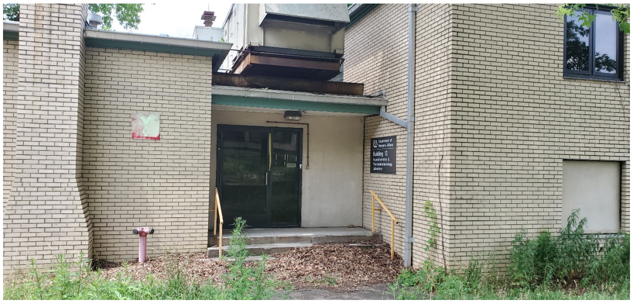
Entry bridge with mechanical system above