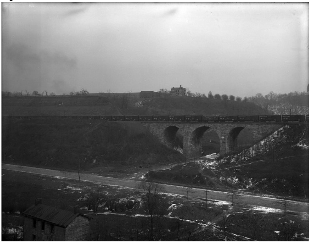
Figure 3 – Leech Farm, 1913