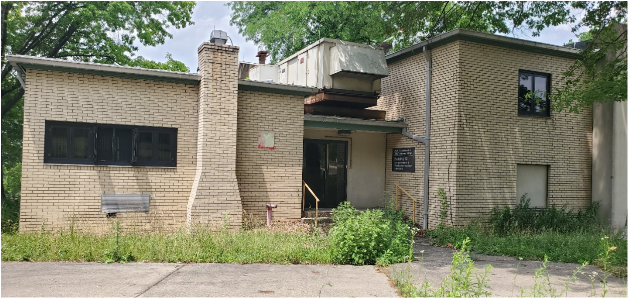
Eastern elevation, one-story south section and middle entry bridge