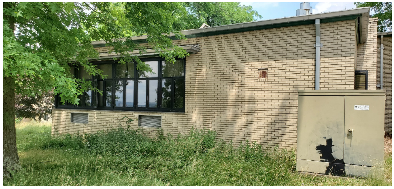
Southern elevation, one-story south section