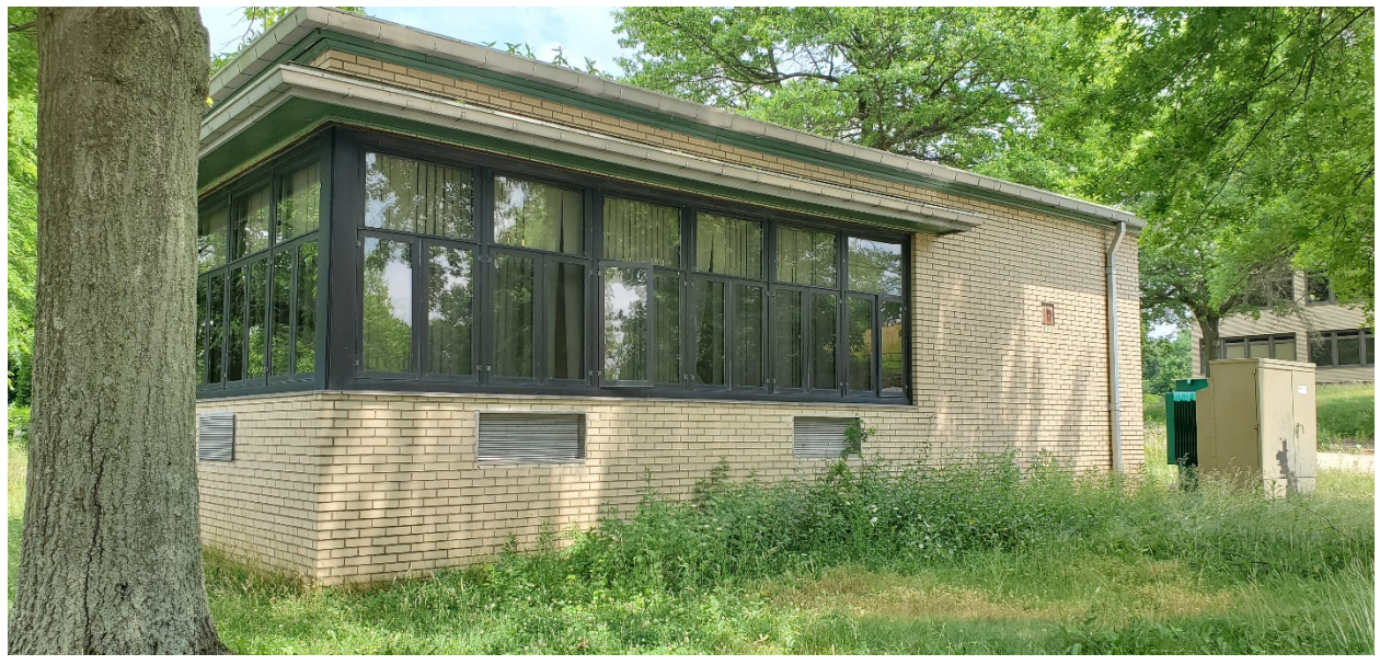
Southern elevation, one-story south section